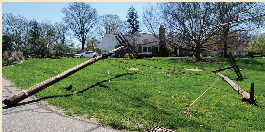
Downed power lines and transformers left much of the Village without power following recent storm activity. Storms hit multiple neighborhoods, with Amberley Village among those most critically affected. Crews from other communities assisted with cleanup efforts.

As brush collection is not an essential service, the collection of brush will be suspended after the storm damage is cleared and while we are still under a State of Emergency. Residents are asked not to place brush at the street after April 24.